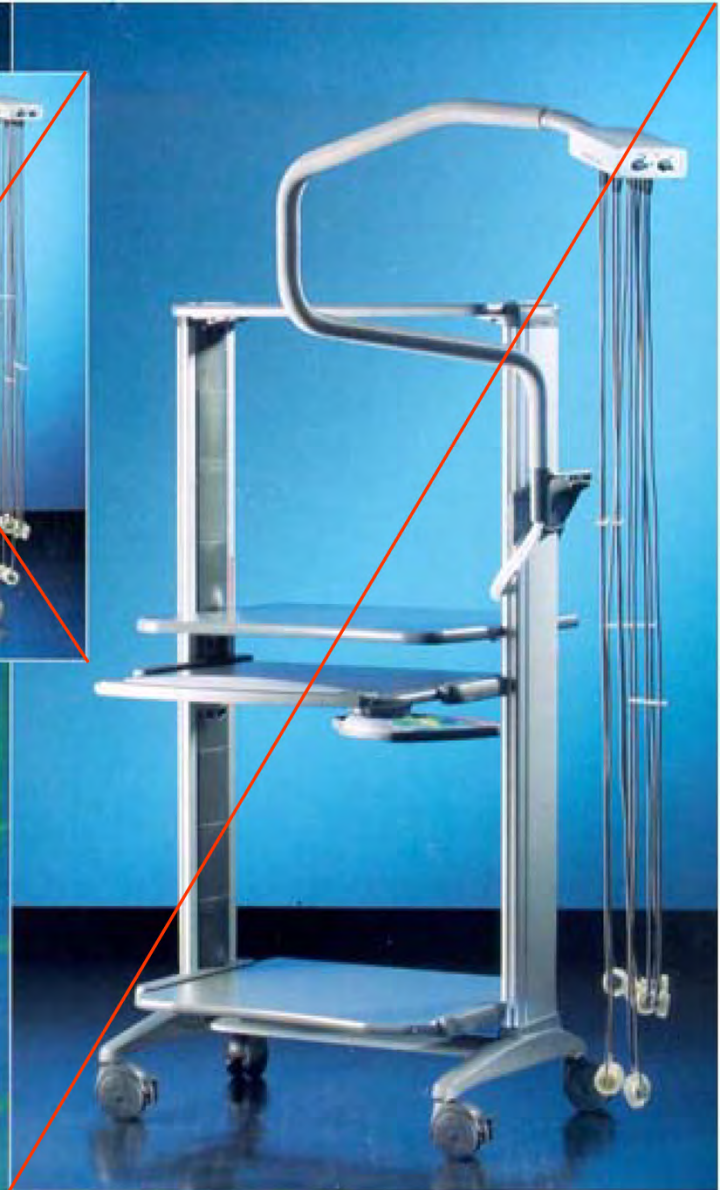
VACUCAR PC PLUS